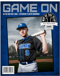
L. Magazine Cover - $10

Photos are for illustration purposes only. Designs may vary and colors will be matched to team.