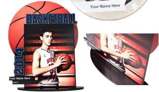
U. Acrylic Stand-Ups $20